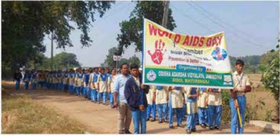
AIDS DAY CAMPAIGN, OAV JAMIRDIHA, BISOI, MAYURBHANJ