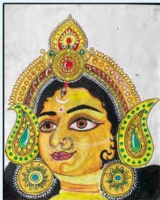
SUBHALAXMI MOHAPATRA, CLASS-VIII OAV JOKIDOLA, BANKI