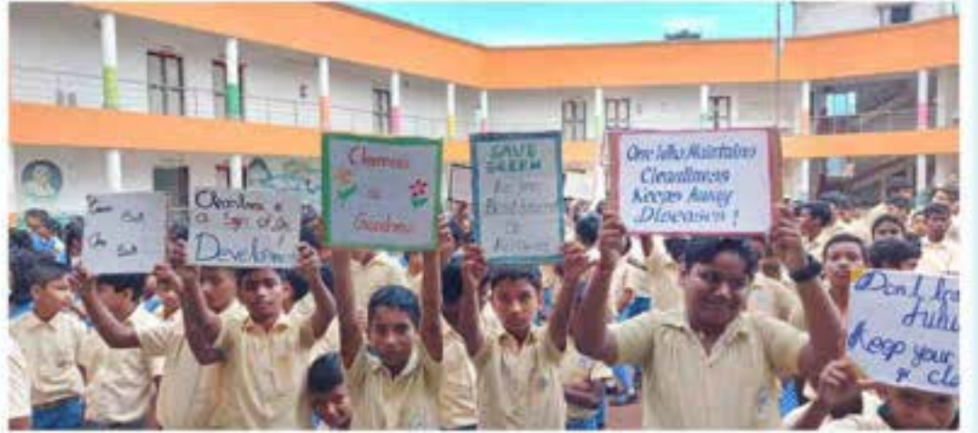
CLEANLINESS CAMPAIGN, OAV JAMIRDIHA, BISOI, MAYURBHANJ