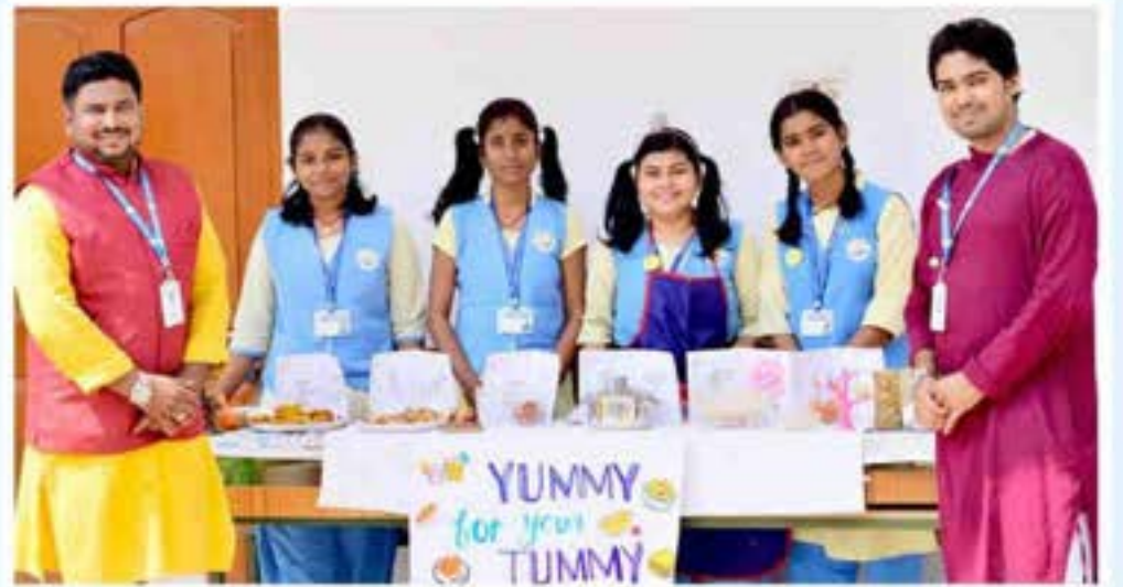
FOOD FESTIVAL, OAV TARANDO, BARO, KENDRAPARA