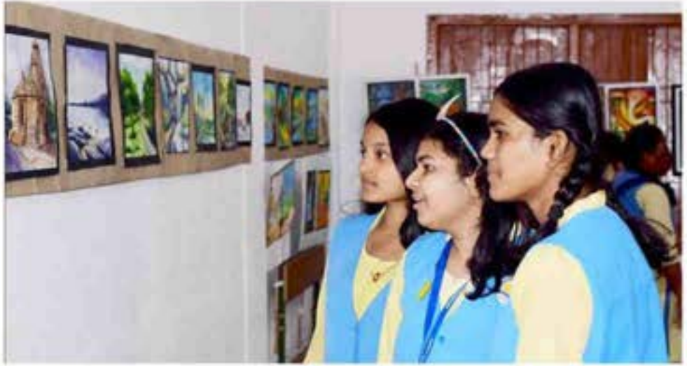
ART EXHIBITION, OAV TARANDO, BARO, KENDRAPARA